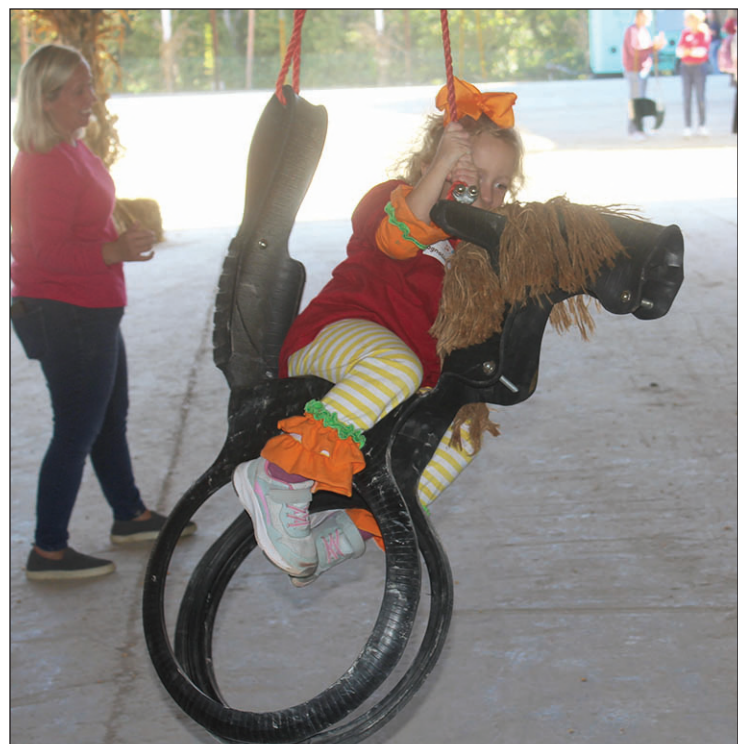
BUY PHOTOS AT PARISPL.NET